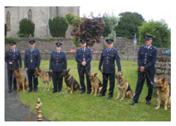
The Garda Dog Unit celebrated 50 years in existence in 2010.

Training is conducted by the Garda Dog Unit and continues daily for the duration of a dog's career. The dogs live in their handler's home, so they build up a relationship with their handler, although they understand the difference between work and off duty.