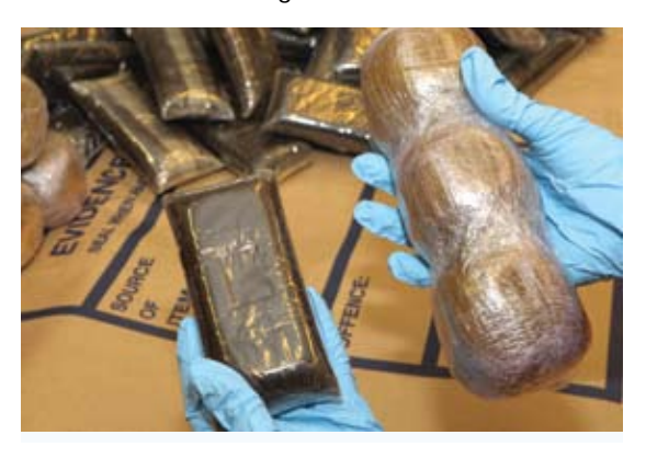
Operation Shovel was a multi-national operation which targeted one of the largest Irish crime gangs who wielded control over a large portion of the European drug trade.

Crime legislation). These were the first arrests to be made under this new legislation.