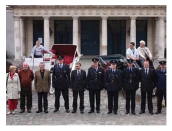
The very last inspection of horse-drawn carriages took place in Dublin Castle in May 2010.

It was the end of an era for the Carriage Office on 31 May 2010 when the very last inspection of horse-drawn carriages took place in Dublin Castle. The Office, which had been based at the Castle since 1856, has now moved to Santry.