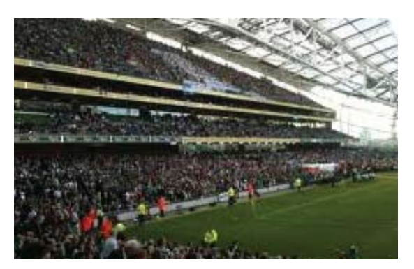
Gardai were closely involved during the construction and development of the Aviva Stadium.

on wheels' and visited older residents throughout the area. Gardaí cleared snow and gritted paths to ensure access to local shops, and bought food and other supplies where necessary. This contact helped to further the existing good relationship between Gardaí and people in the community.