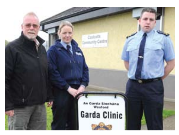
One of the four new community clinics that opened in Wexford in 2010.

Four new community clinics were opened in the Wexford Division. The clinics offer the community a chance to have their passport or tax renewal forms signed or to talk to their local Gardaí. The initiative has had a great response from the community.