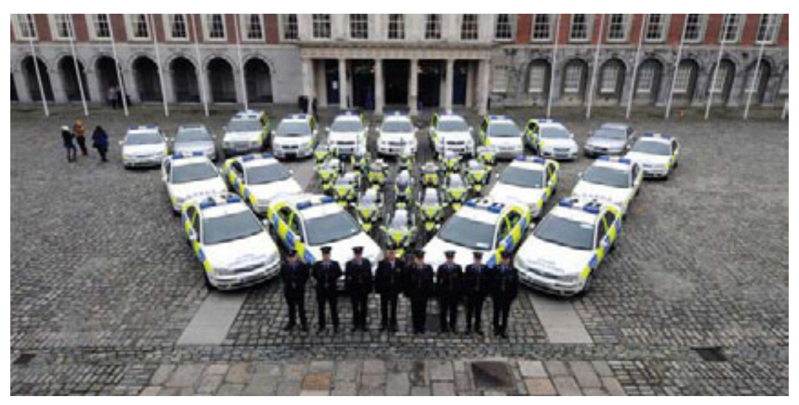
A fleet inspection takes place at Dublin Castle in November 2010.

CARS is now in its fourth year on the Dublin Institute of Technology (DIT) curriculum. The Garda Road Safety Unit has been an integral part of the CARS Programme since it began four years ago.