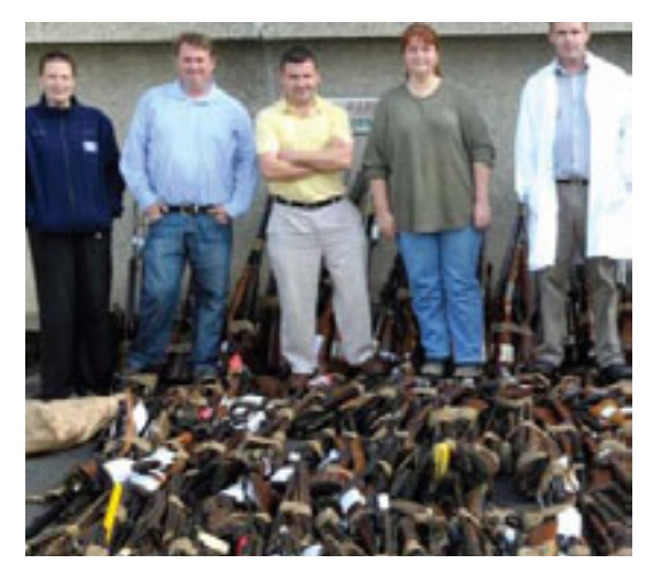
Members of the Ballistics section with some of the thousands of firearms that were voluntarily handed in at garda stations throughout the country.

A major benefit of the new licensing system is that over 45,000 old one-year licenses were cancelled from the system. This resulted in the voluntary handing in of thousands of unwanted firearms at garda stations throughout the country. The firearms were then destroyed free of charge. This is a service for which firearm certificate holders might otherwise have had to pay.