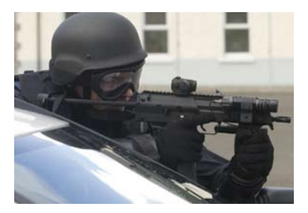
The Emergency Response Unit (ERU) is under the remit of the Special Detective Unit.

teams. Members of the ERU received training in France, Greece, Holland, Germany and the UK.