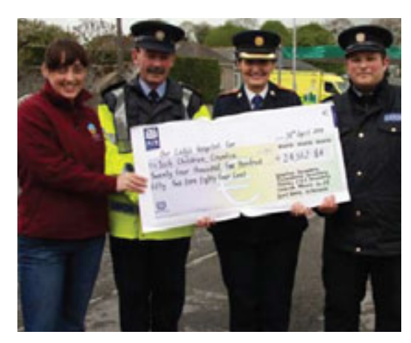
Gardaí from Thurles helped to raise 24,552.84 for Our Lady's Hospital for Sick Children with the "Wellie Run" in April 2010.

which is awarded by our Lady's Hospital.