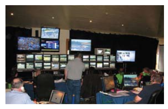
The new joint event control room at Oxegen facilitated more efficient incident management and crowd control.

The annual Oxegen festival was held at Punchestown Racecourse, Naas, Co. Kildare from the 8th to 12th July 2010. This event is the biggest outdoor musical festival held in Ireland. Over 70,000 campers stayed on a 400 acre site for five days and a further 10,000 non-campers attended daily.