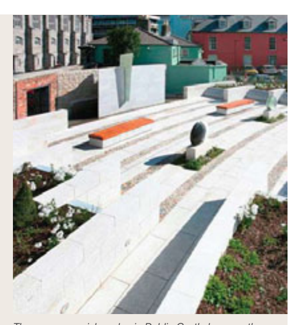
The new memorial garden in Dublin Castle honours the 83 Gardaí who were killed in the service of the State.

Speaking at the opening the Garda Commissioner said: "At 83 different moments in the last 88 years, time has stood still for the entire Garda family as reports have come in that there has been an incident - maybe a shooting, a collision, a drowning - and a colleague has been lost." The Commissioner commented that it is important that we take time to recognise and reflect on