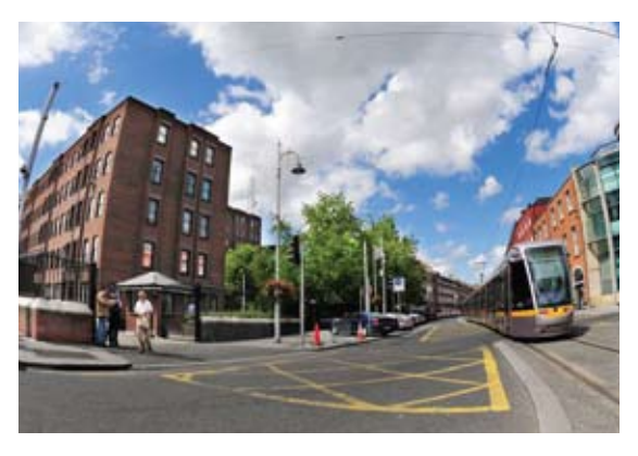
The Special Detective Unit is based in Harcourt Square in Dublin.

The SDU continues to gather, analyse and disseminate information relating to groups and individuals involved in subversive activity, global terrorism and organised crime. It also liaises with its European and worldwide partners to better share and analyse information. This co-operation allows a targeted approach against cross border terrorist activity, which has resulted in the prevention and disruption of offences carried out by dissident republicans.