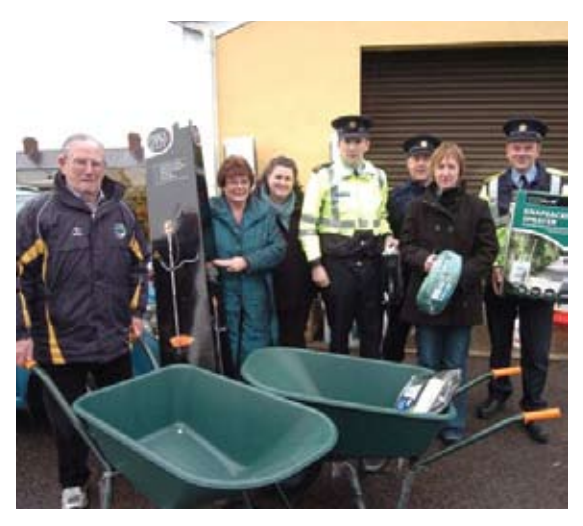
Community Gardaí present Residents Groups with equipment in November 2010.

Free smoke alarms, high visibility jackets and crime prevention information leaflets were handed out to all attendees. About 100 people attended and the event was well received. As a result, similar events were run in each of the Meath Districts in 2010.